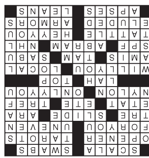
Solution time: 21 mins