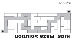
Kids' Maze Solution

ADVERTISE STATEWIDE with a $325 classified listing or $1,575 for a display ad. Call this newspaper or 360-344-2938 for details.