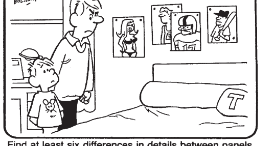
Find at least six differences in details between panels.