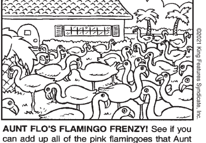
AUNT FLO'S FLAMINGO FRENZY! See if you can add up all of the pink flamingoes that Aunt Flo has put in her front yard. (Count them with a friend and see if you both get the same total.)