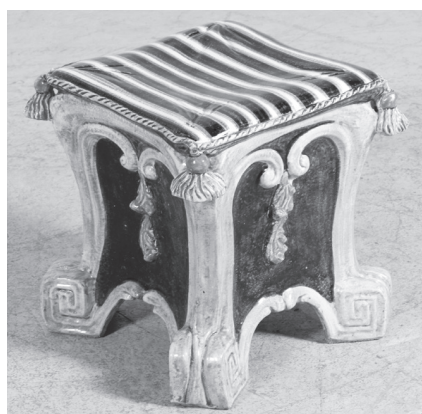
This majolica stool was made in the 20th century. It is square instead of the antique barrel shape, but still shows the influence of 19th-century style.

A: Don't use the casseroles if the tin lining is worn off. Direct contact with tomatoes or other acidic food can cause small amounts of copper to leach into the food. If you live near a big city, you might find a local metal repair shop that does re-tinning. If there is no one near you, you can find other places online. The com-