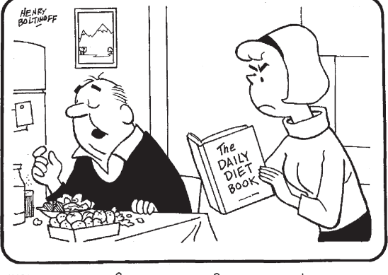
Differences: 1. Book title is different. 2. Woman's hairdo has changed. 3. Picture is added to wall. 4. Man's fork is gone. 5. Woman's apron is missing. 6. Woman's right hand is hidden.