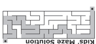
Kids' Maze Solution

PAIR OF Banty chickens- rooster & hen. Feather legged & friendly. Not for the soup pot, please! 509-299-3441.